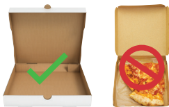
Recyclables must be free of food, grease and liquids