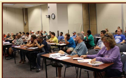
Nearly 70 residents attended this summer's Landlord/Tenant Counseling workshop.

E arlier this year the city launched Neighborhood College, an exciting series of instructor-led, highly participatory workshops designed to increase your knowledge of the city, teach you how to access city resources, and provide you with the skills and ideas to build positive, sustainable communities. The Navigate Phoenix "track" features our most popular