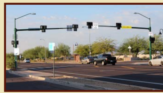
The HAWK at 24th Street and Wier Avenue in South Phoenix.

The first HAWK in the Village was installed last October at 24th Street and Wier Avenue. In December 2011, Brooks Academy (located east of 24th Street) closed its campus, which caused students to cross the busy 24th Street to attend Percy L. Julian School located west of 24th Street. It was critical that more intense traffic signals be installed to provide for safer student crossings.