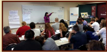
Residents at a counseling workshop facilitated by Neighborhood Housing Services of Phoenix.

reading and understanding mortgage loans, choosing a home that meets the family's budgetary needs, and strategies on maintaining the home.